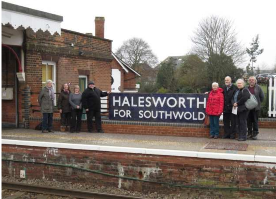
Halesworth Museum Friends proudly showing off the newly acquired station sign.

A relic of railway history is to return home to Halesworth, after being snapped up at a memorabilia auction.