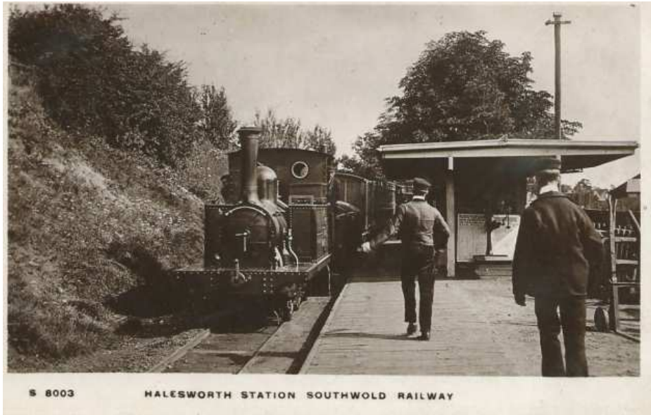
A postcard showing how the Halesworth for Southwold line looked.